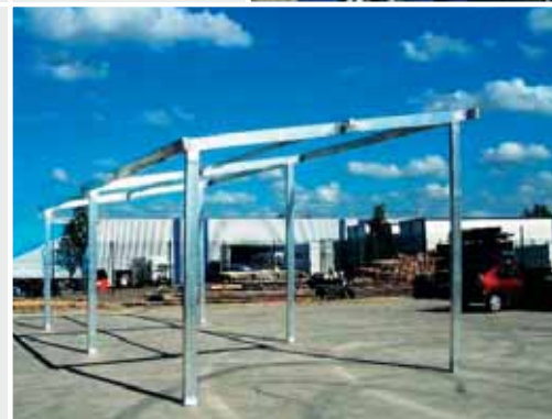
To ensure that all parts fit together properly each FS Meridian is pre-assembled in our factory prior to delivery.