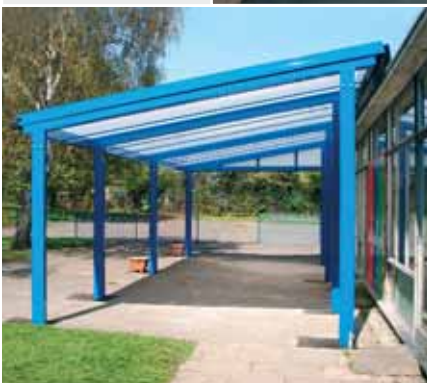
FS Meridian canopies positioned adjacent to schools where the buildings do not have either sufficient height, or the structure, to support a standard lean-to Meridian