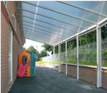
Meridian Canopies outside two schools

The aluminium frame is available as standard in white, brown or black. In addition, most standard RAL colours are also available – although choosing a non-standard colour may extend the delivery time a little.