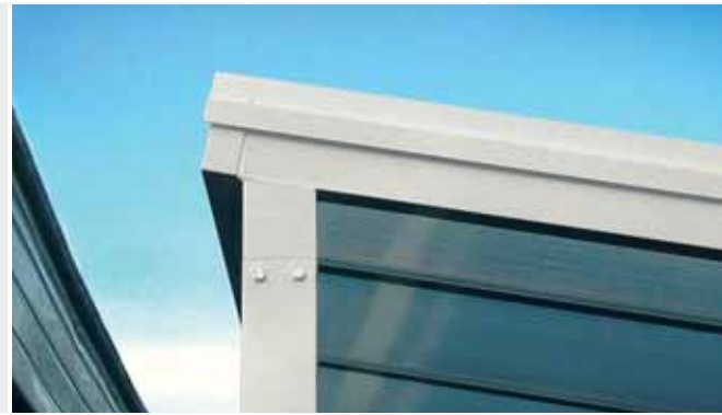
Simple 'bolt together' aluminium sections make Meridian canopies quick and easy to assemble

The Twinfix specification for canopy foundations is available upon request